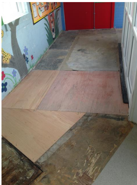
Just waiting for the new flooring.